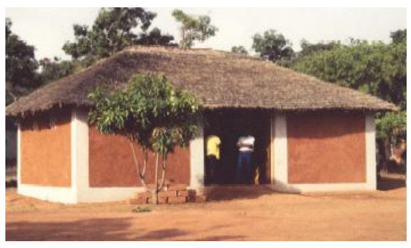
Figure 4: Demonstration house in Jos, Nigeria, built with adobe laid in mud mortar and plastered with mud mortar.

On the other hand some additional operations are necessary when the mud mortar is stabilised. To get a good homogenous distribution of the stabilizer in the mixture, it is necessary to sieve out or crush the lumps in the soil that