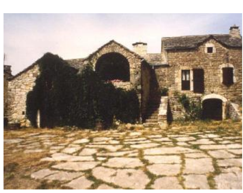
Figure 1: House, Built of stone laid in mud mortar with paving stone yard of stones in mud mortar.

A mud mortar is prepared by simply mixing soil with water until it is in a plastic (workable) state. Once applied, a mud mortar sets quite rapidly on drying without the need for elaborate curing procedures.