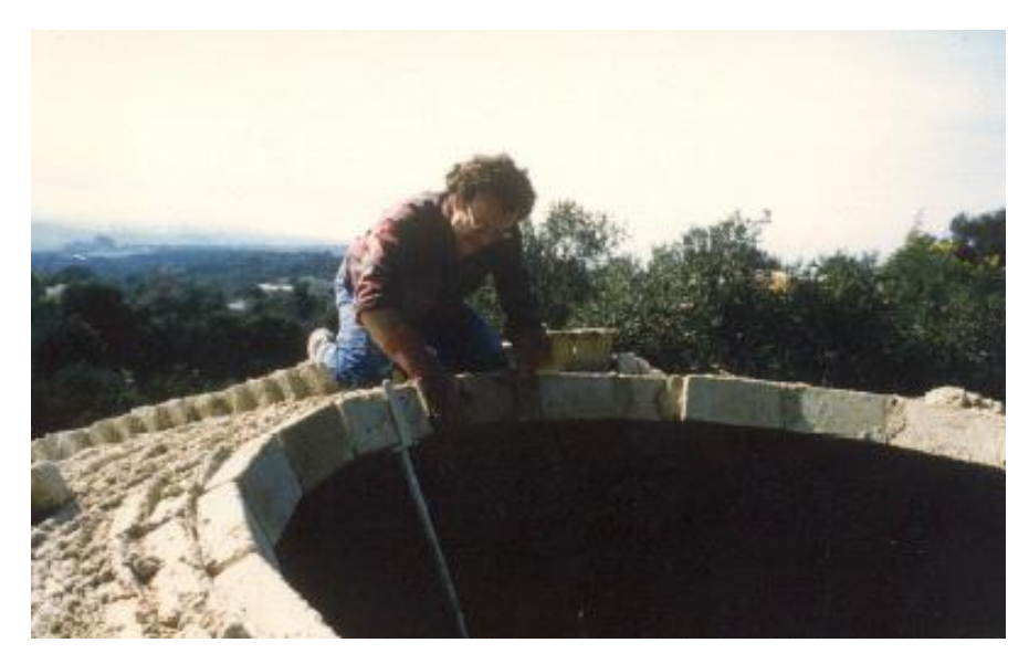
Figure 2: The good cohesion of mud mortar allows construction of vaults and cupolas without shuttering.

Mud-based mortars can be applied to masonry, monolithic walls and wattle and daub, and even to flat roofs, vaults and domes. They function as a waterproofing coat and also improve the appearance of a building. External renders are liable to wear away at a rate depending on the harshness of the exposure conditions. They require regular maintenance and periodic repair, although if well-protected they can last a very long time indeed.